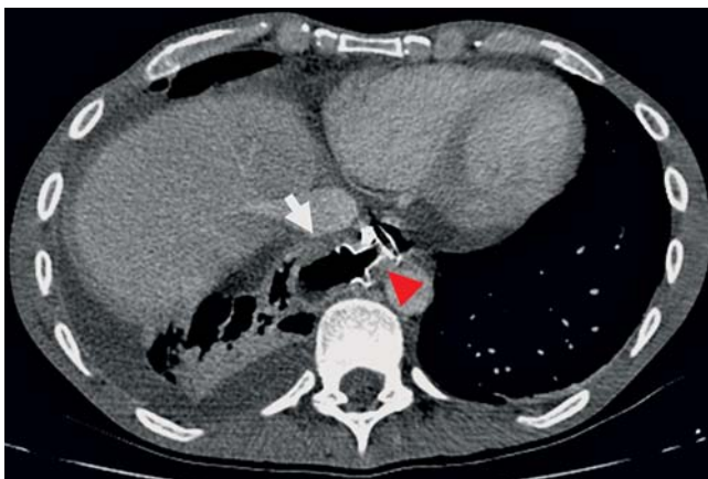
Fig. 3 Follow-up computed tomography (CT) scan after 7 days showing the AXIOS stent (arrowhead) still in place with significant resolution of the lesion (arrow).