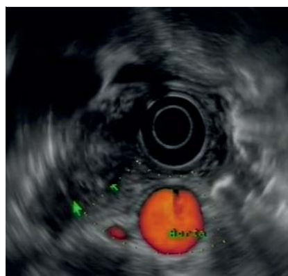
Fig. 5 Follow-up endoscopic ultrasound (EUS) image 6 weeks later showing complete resolution of the lesion.

There have been a few previous reports of transesophageal endoscopic ultrasound (EUS)-guided drainage of pancreatic fluid collections (PFC). In these reports the drainage modality has been a single aspiration or deployment of a plastic stent [1–4]. We report a patient who underwent transesophageal EUS-guided drainage of a mediastinal PFC using a novel lumen-apposing metal stent.