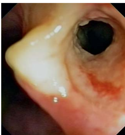
Fig. 4 Endoscopic view of the cystoesophagostomy after the stent had been removed.