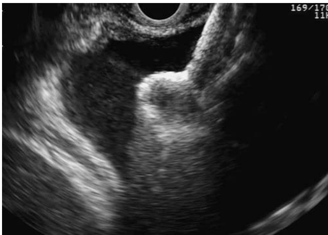
Fig. 1 View during endoscopic ultrasound (EUS)-guided placement of a lumen-apposing metal AXIOS stent across the cystoesophagostomy.